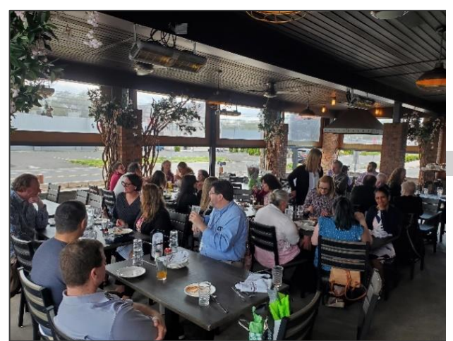
Attorneys and staff of the law firm of Davison Eastman Munoz Paone, P.A. enjoy time away from the firm celebrating each other and collective accomplishments.

The firm is comprised of 20+ attorneys, and an outstanding group of over a dozen paralegals and support staff from administration to accounting to operations professionals.