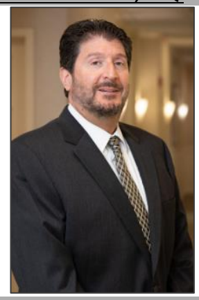
PARTNER TITLE DISPUTES & REAL ESTATE LITIGATION TIDELAND & RIPARIAN RIGHTS COMMERCIAL LITIGATION